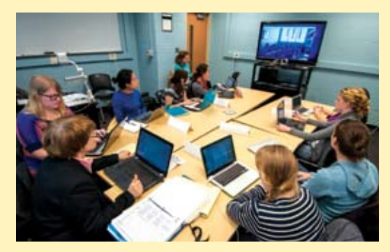
A new program allows community health nursing students to build relationships with peers in Haiti through videoconferencing.

A new U.S. Department of Education grant for undergraduate international studies and foreign language learning provides unique resources and opportunities to enhance language learning and