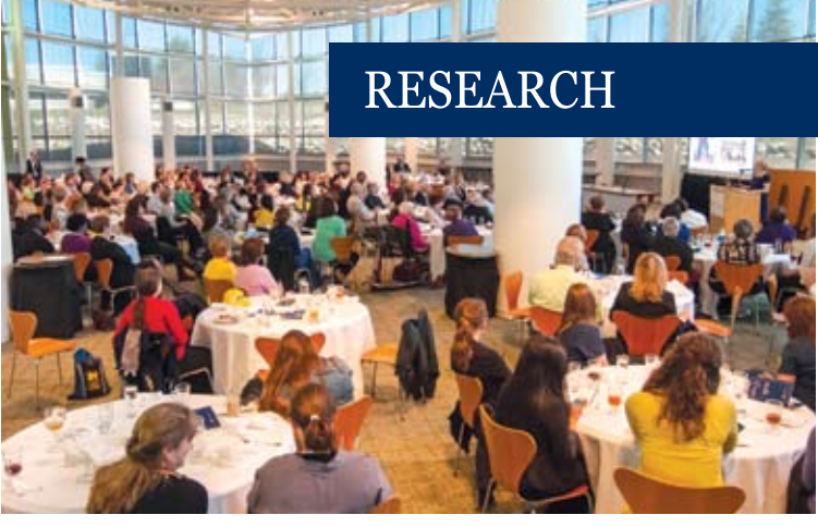
A full room for the day at U-M's North Campus Research Complex.

Attendees noted how inspiring it was to have so many nursing science supporters together. Will you join us in 2014 (tentatively April 3)?